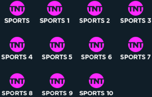
TNT SPORT LOGO & CHANNEL S 1-10 STACKED ON DARK BACKGR OUNDS